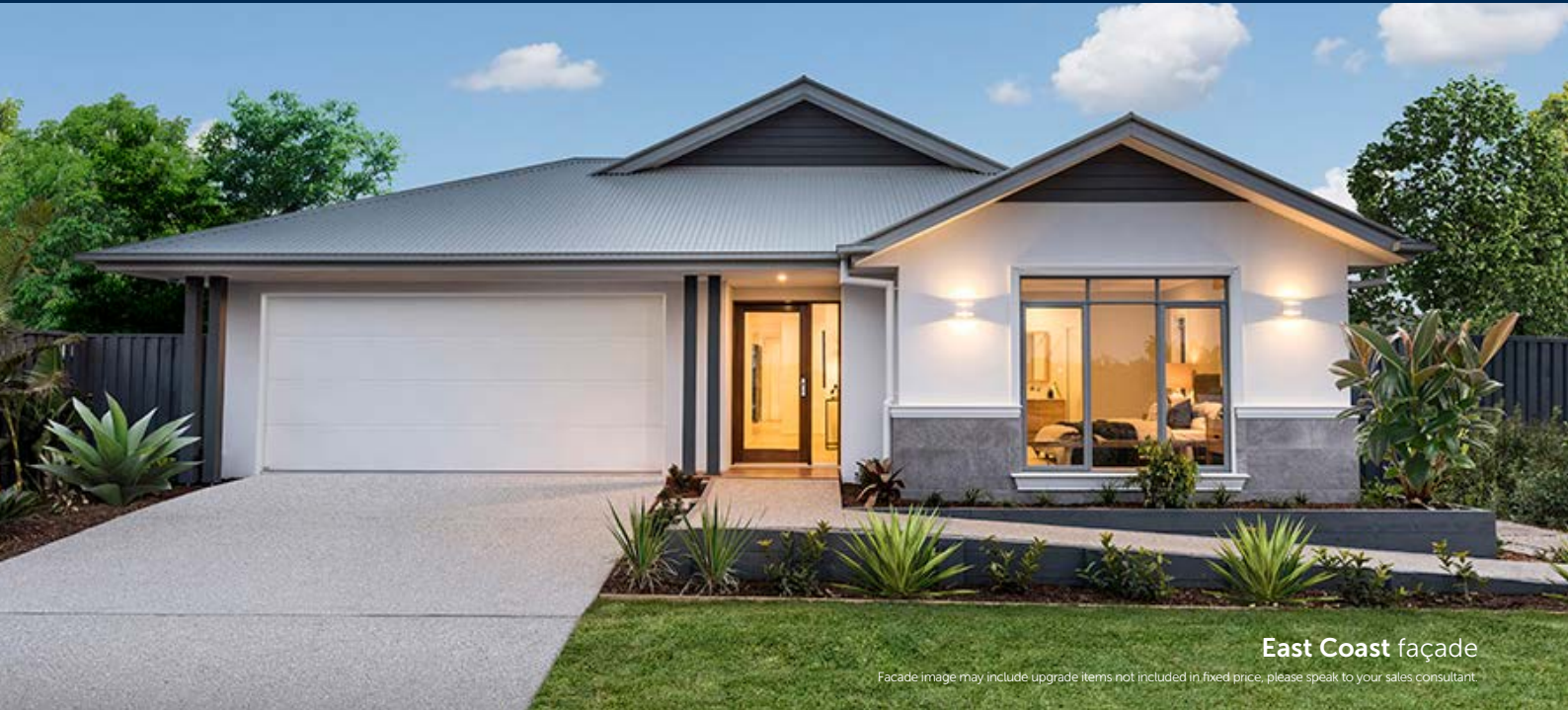
East Coast façade

Facade image may include upgrade items not included in fixed price, please speak to your sales consultant.