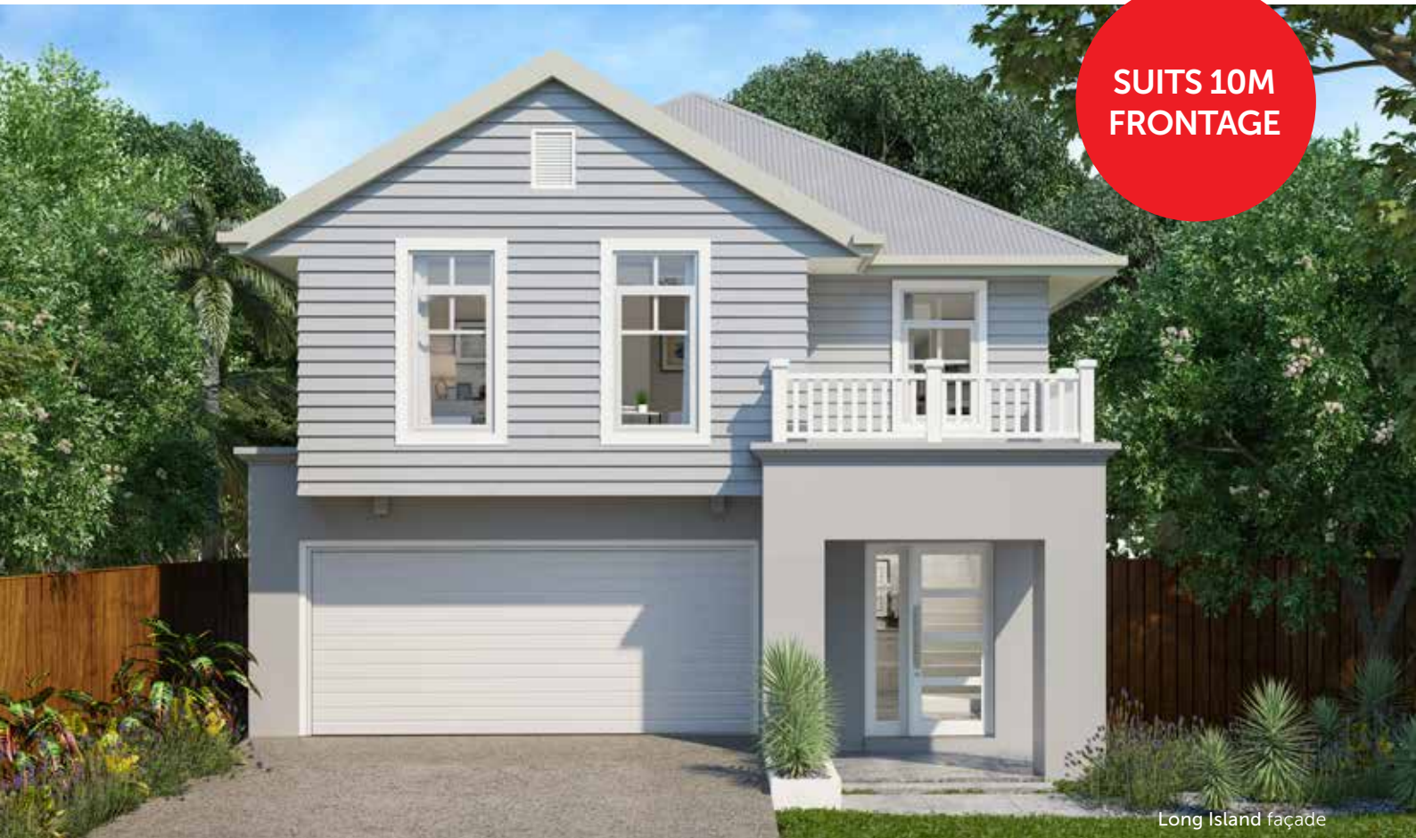
Long Island façade