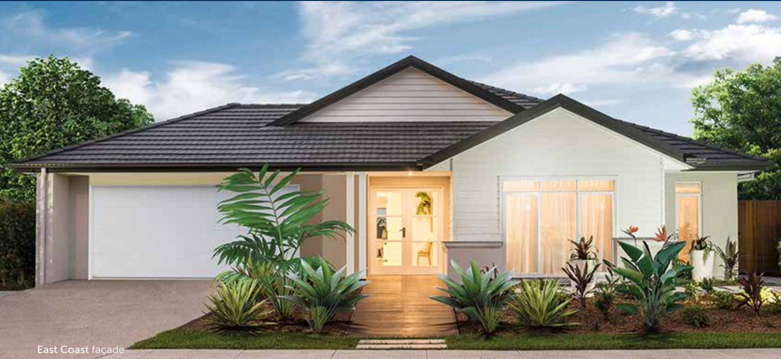
East Coast façade