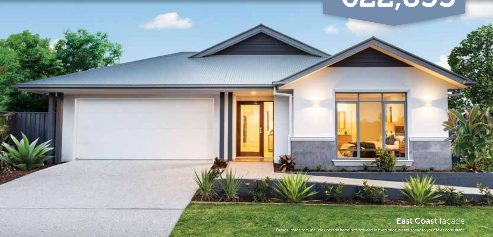
East Coast façade

Facade image may include upgrade items not included in fixed price, please speak to your sales consultant.