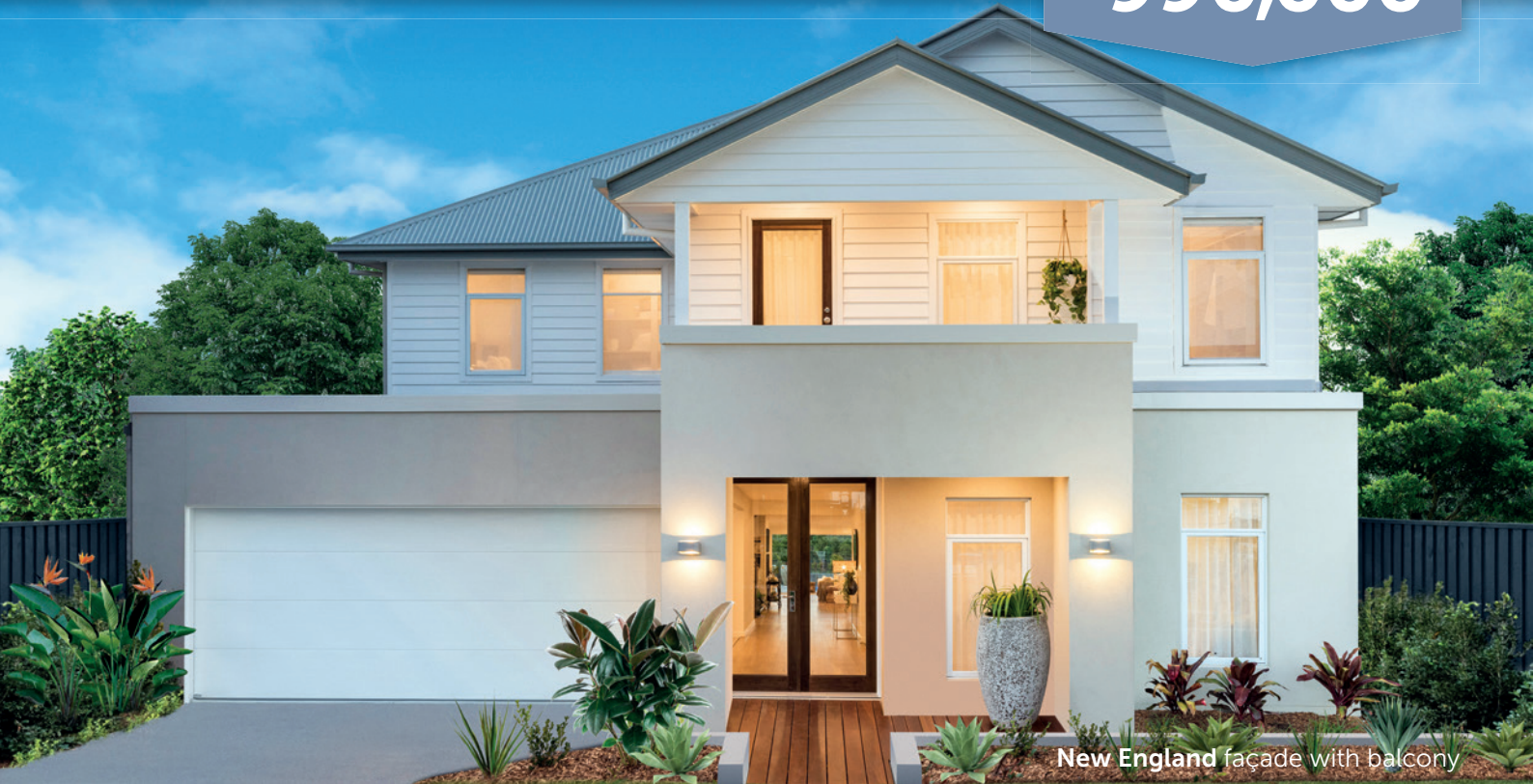
New England façade with balcony