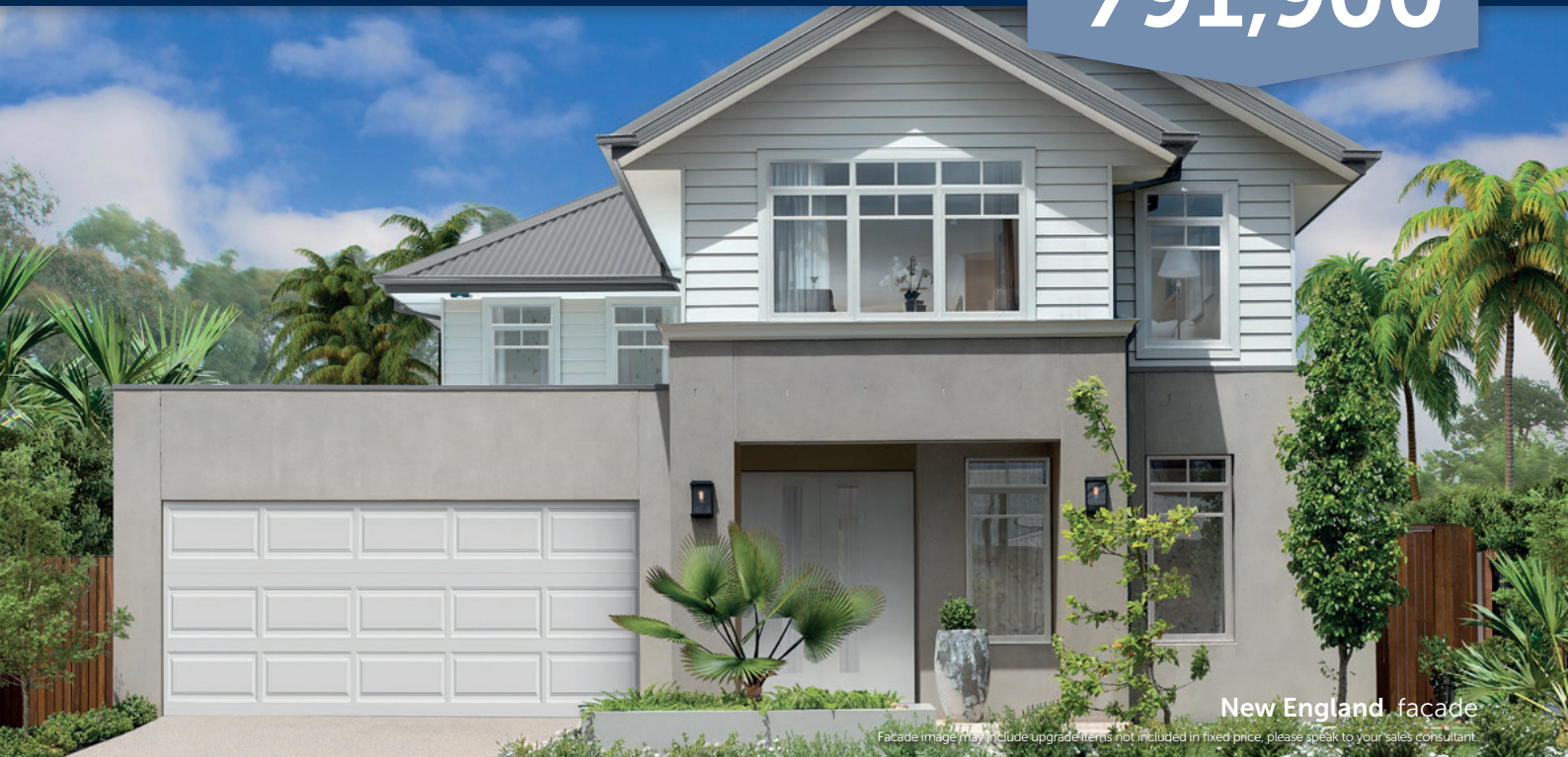
New England façade

Facade image may include upgrade items not included in fixed price, please speak to your sales consultant.