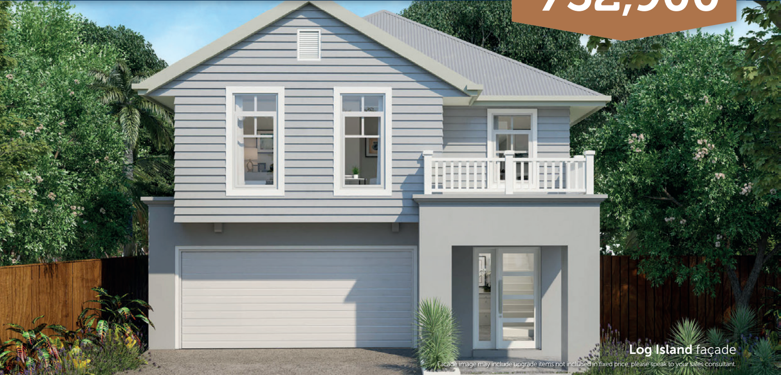
Log Island façade

Facade image may include upgrade items not included in fixed price, please speak to your sales consultant.