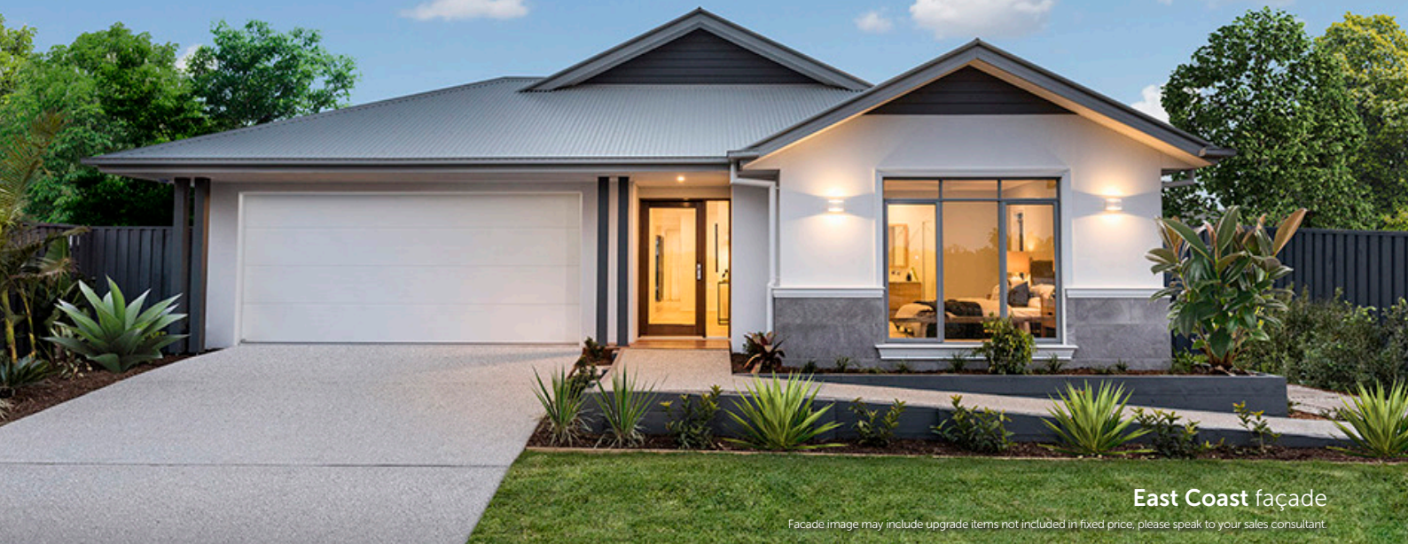
East Coast façade

Facade image may include upgrade items not included in fixed price, please speak to your sales consultant.