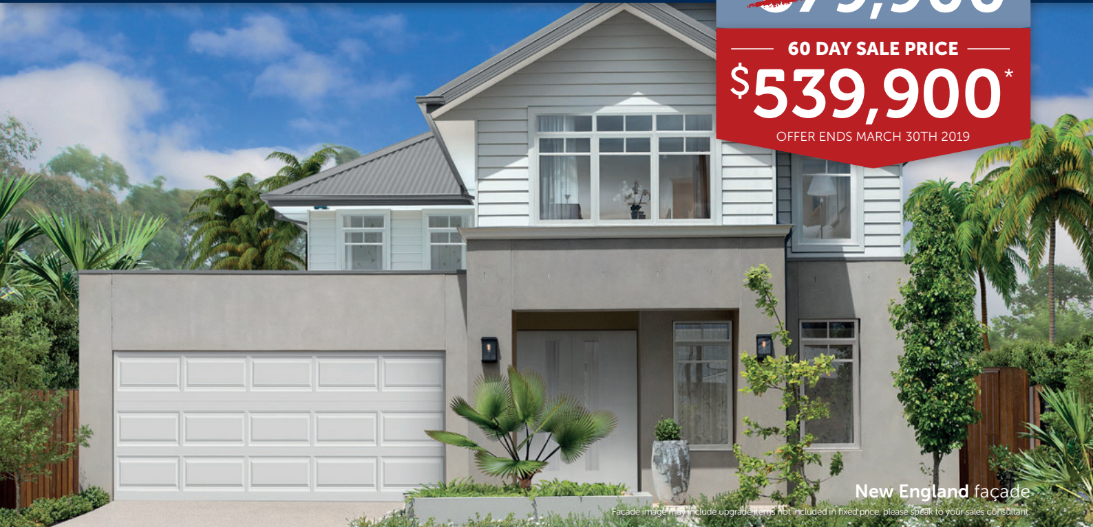
New England façade

Facade image may include upgrade items not included in fixed price, please speak to your sales consultant.