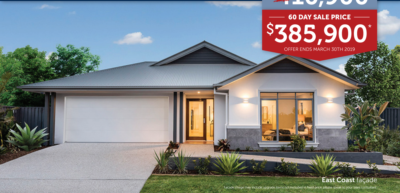
East Coast façade

Facade image may include upgrade items not included in fixed price, please speak to your sales consultant.