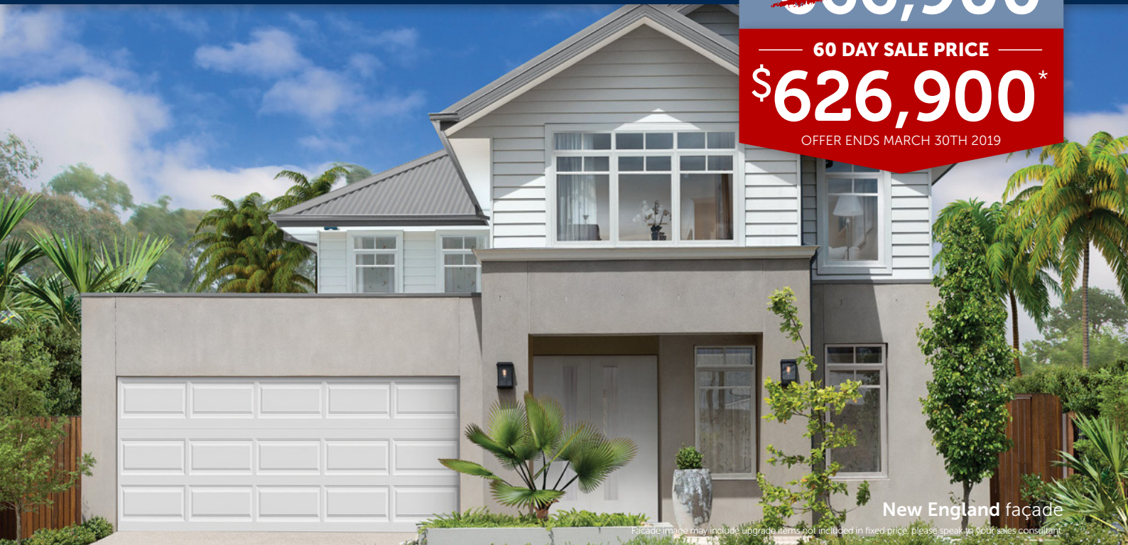
New England façade

Facade image may include upgrade items not included in fixed price. Please speak to your sales consultant.